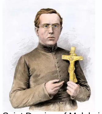
Saint Damien of Molokai

The Albany Damien Center opened in 1988 and was incorporated in 1990 as the first AIDS drop-in center in the United States. Named after Saint Damien of Molokai, who ministered to people with leprosy in the 1800s, the Damien Center is not a faith-based organization, yet invites persons from all religious and spiritual paths to join in our efforts to participate in Damien Center services and activities.