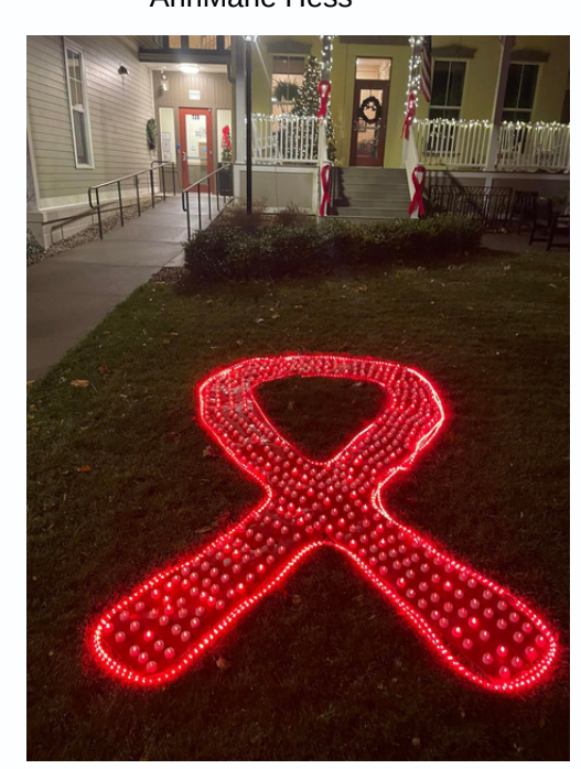
Dec 1, 2023 World AIDS Day Damien Center Front Lawn