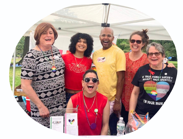
Our team at Albany Pride 2023!

Titles presented at new Queer Lit Library